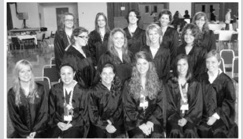
Supreme Court Justice