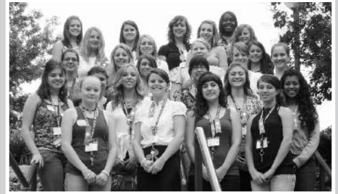
State Board of Education