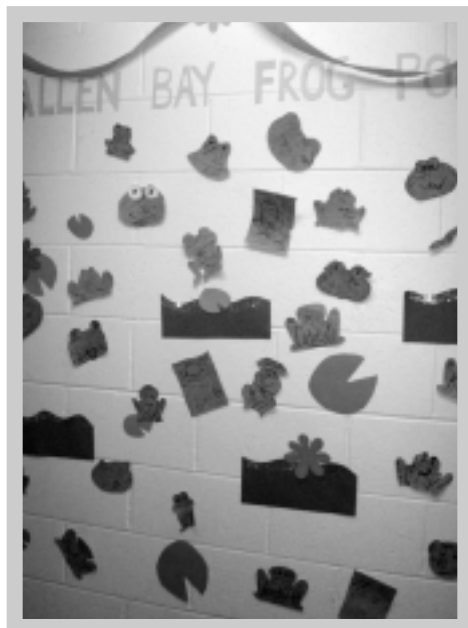
Allen Bay/City "Frog Pond"

Here at Allen City, also known as Allen Bay, we take pride in finding alternative ways of using energy. Using energy in an environmentally friendly way is extremely important due to the recent events in the use of pollution and global warming. Some of the ways in which we conserve energy in Allen Bay are by using the following: wind energy, by using a colorful windmill; solar energy, by using a creative sun and beach; and a watermill that is surrounded by an interesting frog pond. Other ways we practice environment conservation are by exhibiting nature reserves and throwing recycling parties.