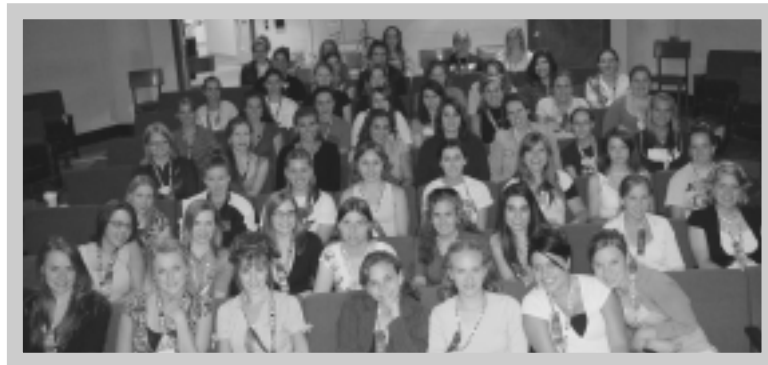
State House of Representatives