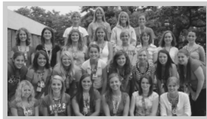
State School Board