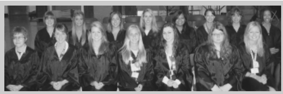
Judicial Government Officials