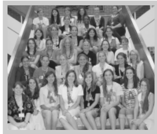
County Government Officials