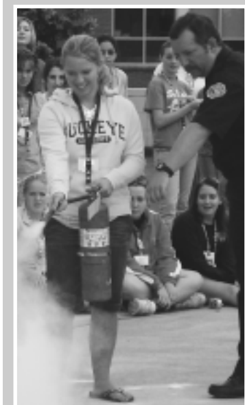
BGS Fire Chiefs participate in a fire extinguisher demonstration.