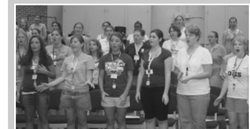
BGS Chorus practices late at night for a wonderful performance.