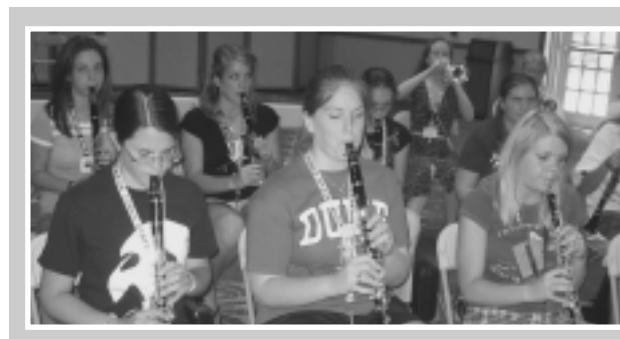
BGS Band members rehearse to perfection in the Upper Convo.