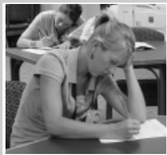
BGS Citizen takes the Highway State Patrol Exam.