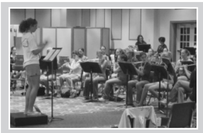
THE BGS BAND rehearses in the Upper Convo.