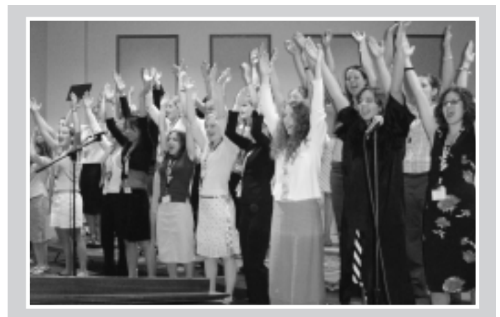
The BGS chorus performs at the city government celebration.