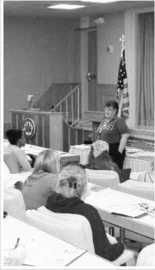
Girls at the workshop